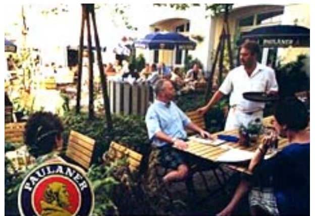
PAULANER IM TAL